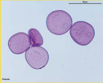
Grass pollen as seen under a light microscope

Why some hay-fever sufferers grow out of their disease, whilst others progress to more persistent problems .