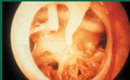
This patient has a hole in their right ear drum. The small ossicle bones can be seen through the hole.